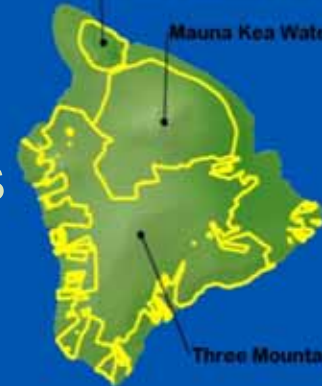
Mauna Kea Watershed Alliance