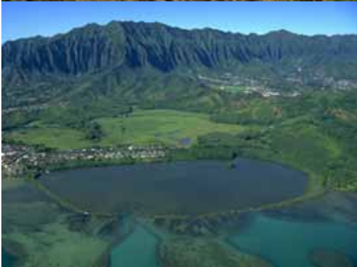
Kauai Watershed Alliance