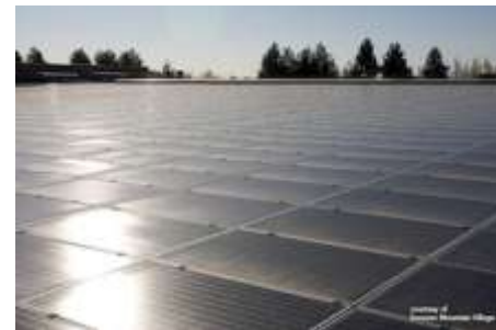
A portion of the Sonoma Mountain Village solar system currently under construction.